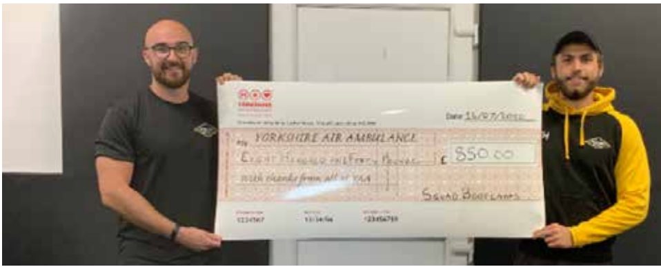
Thank you to Squad Training Limited who have raised £850 for the YAA from online fitness camps over Christmas and throughout lockdown.